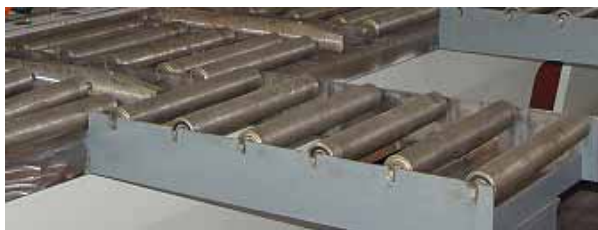
Transferring rollers for heavy sheet