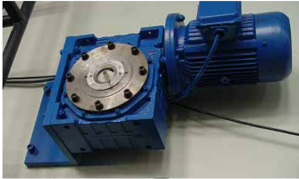
Motorized blade clearance adjusting system, be adjusted through operating the PLC, convenience to adjust the blade gap according the different sheet thickness.