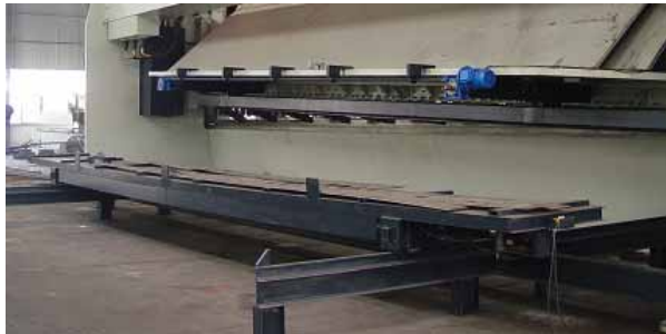
Bask side sheet loading system,