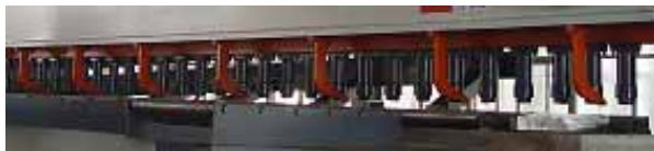
Heavy duty bar to protect the hold downs avoiding be collided by the sheet during the feeding time